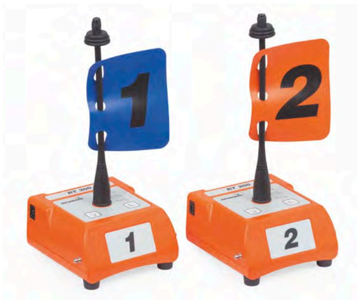
RT 200 radio transmitter

Thanks to the results-oriented view, the user can immediately implement further steps, e.g. confirm the location by acoustic means.