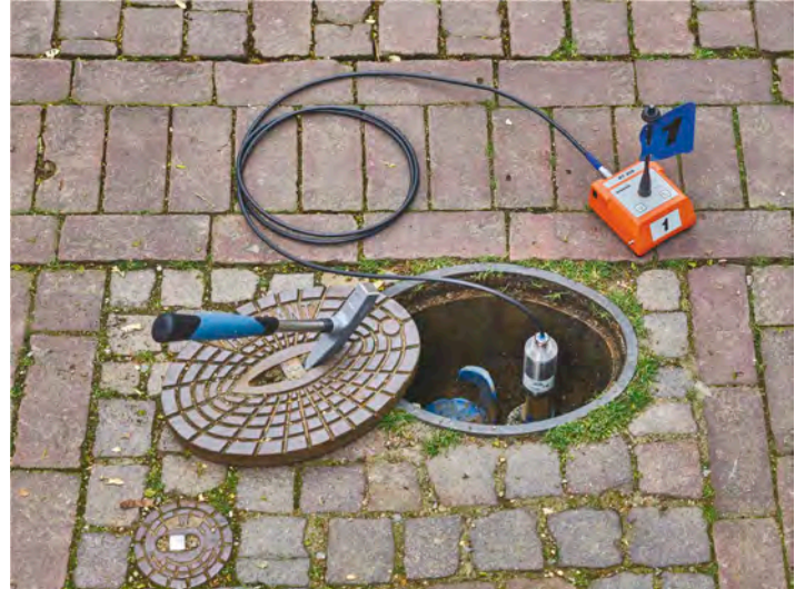
RT 200 radio transmitter with UM 200 microphone in use

The SeCorr® C 200 is lightweight and ergonomic. Its strong triangular belt enables it to be carried effortlessly. The compact, symmetrical housing means that it can be comfortably operated by right and left handers alike. Wireless communication between the receiver and headphones means that the user can work without annoying cables.