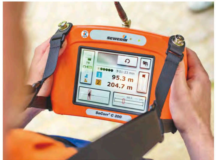
Measurement result shown on SeCorr® C 200 display