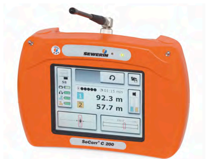
SeCorr® C 200 receiver