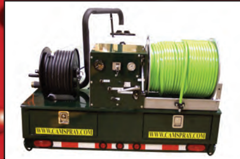
Back of STB4018D, locking tool boxes, control panel, control panel design may vary, tank fill hose, Hydraulic powered reel and hydrant fill.