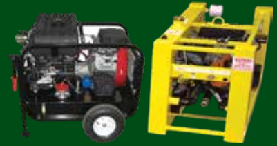
Hydraulic Power Units