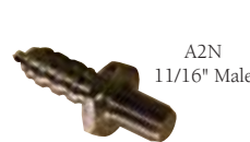
A2N 11/16" Male