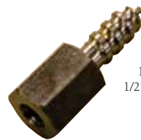
NA14 1/2" Female