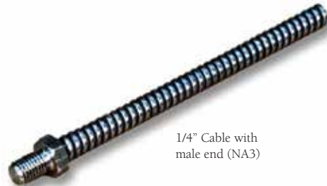
1/4" Cable with male end (NA3)

Ideal for household clogs, sinks, tubs, and other minor jobs, this cable is light enough to maneuver smaller household drains. For use in 1" to 2" lines.