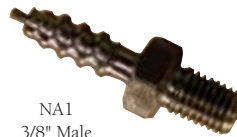
NA1 3/8" Male