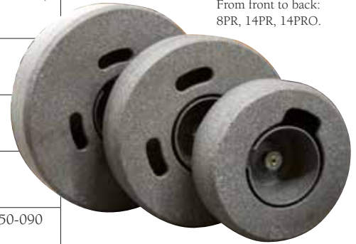
From front to back: 8PR, 14PR, 14PRO.