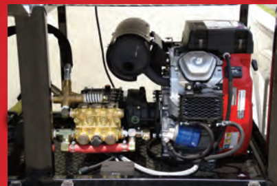
SK2712H Engine and Pump.