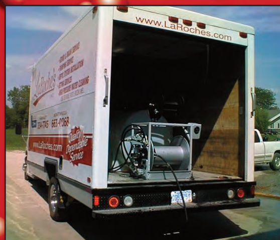
Custom Diesel Powered 18 gpm, 4000 psi in a customer’s Van Body Truck