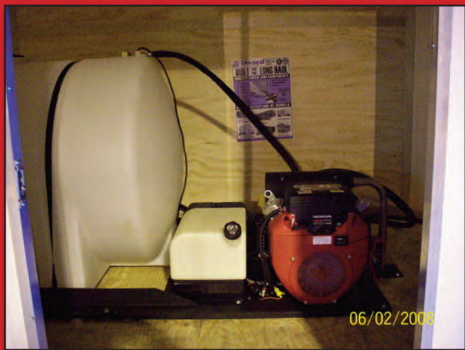
11.5 gpm, 2500 PSI, 325 gallon water tank and hot water option mounted in a customer's enclosed trailer.