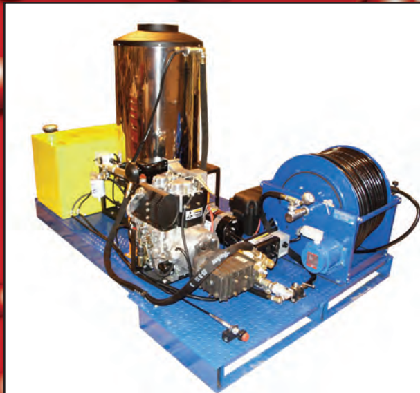
11 gpm, 2500 psi Diesel Driven Hot Water Pick Up Mount for Los Angeles Water District.

Cam Spray has made a reputation for itself in the sewer and drain jetting industry. Cam Spray strives to manufacture affordable and profitable sewer and drain jetting systems using the highest quality components to give you great return on the investment and machine reliability over the long haul. The Cam Spray Sewer and Drain Jetters shown in this catalog have evolved over the past 25 years as “the customer favorites”. Cam Spray has always produced equipment with the owner/operator in mind and our standard models reflect the customer’s needs and wants. However if you do not see exactly what you want, give us a call. Below you will see some examples of custom machines we have built the past few years.