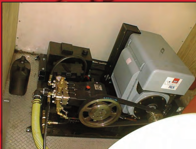
18 gpm, 4000 psi, Hatz Quiet Pack skid.