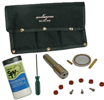
Accessory Kit Included with Live Tracer

Canvas Bag, Stuffing Box, 3 Screws, 6 O-Rings, Rod Lubricant, Hex Key Driver, Adhesive, Replacement Bullet Tip