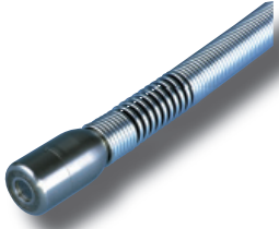
optional self leveling