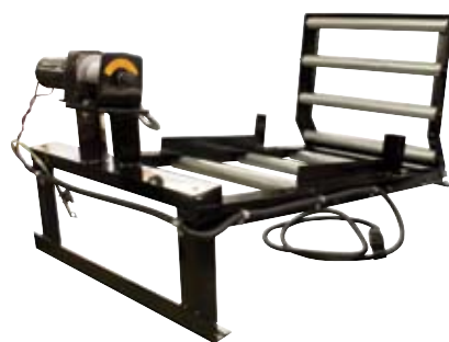
Ramp shown above without EZ-Stor shelf and gate in locked position.