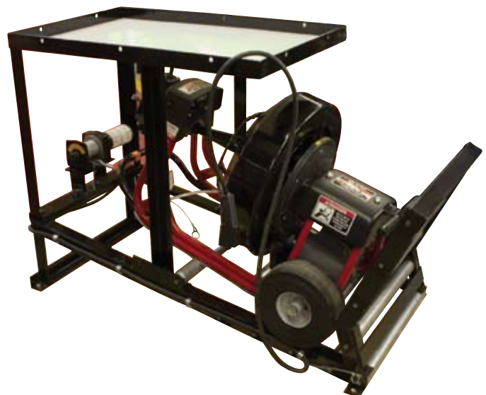
Pictured above is the loading ramp with EZ-Stor shelf and The Knight (DM30).