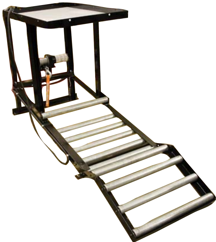
Ramp with EZ-Stor shelf shown above has a footprint of 26-1/4" x 51-3/8"