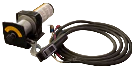
Pictured above is the pulling winch for the loading ramp.

The EZ-Stor Shelf bolts directly onto the loading ramp frame with just four bolts and provides storage for all the extra equipment you need for a job.