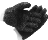
T 17 Regular

Gorlitz's "ugly" gloves are constructed out of a tough PVC material. The palm is molded with small PVC particles to prevent the operators gloves from twisting or snagging. The gloves themselves are acid and oil resistant, flexible, and keep your hands clean and dry. Available in wrist or forearm length.