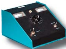
Torpedo Control Box