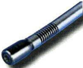
optional self leveling