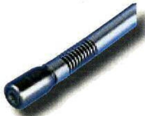
Optional self leveling