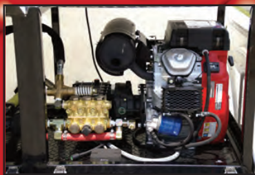
STB2712H Pump and Engine